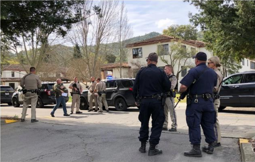
Officers outside the Veterans Home of California after a standoff in Yountville, Calif., on Friday.