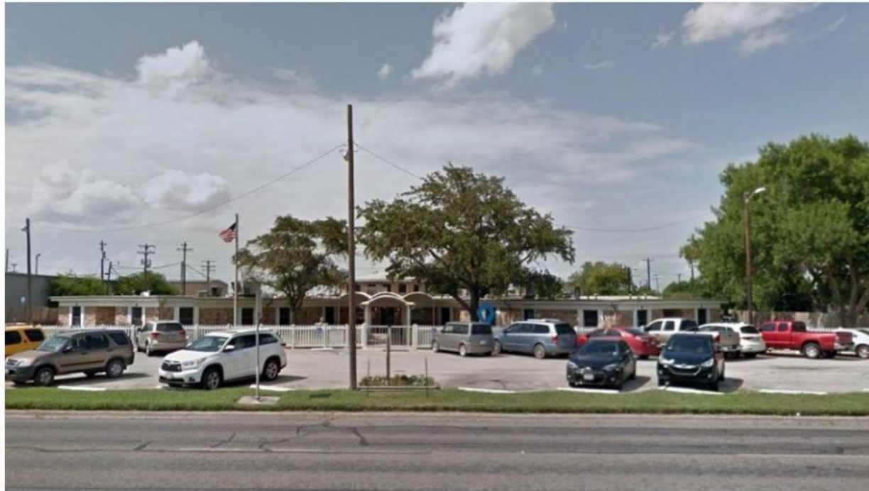
The Retama Manor Nursing Center in Robstown, Texas.